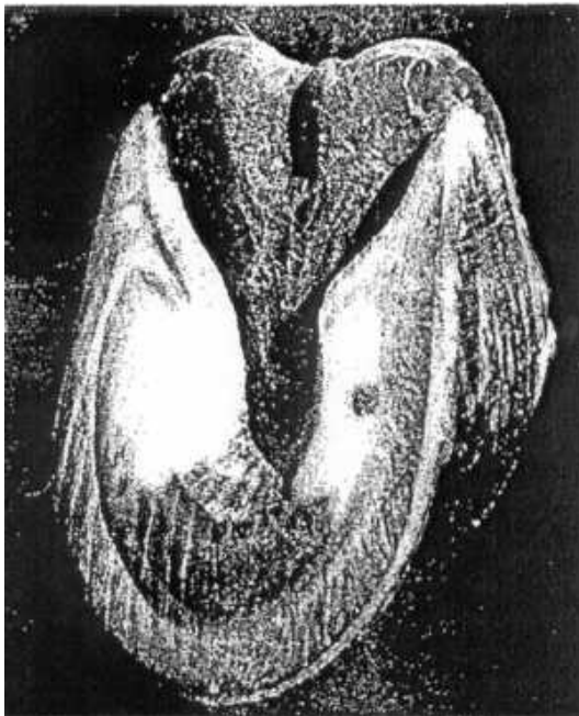
The underside of the hoof